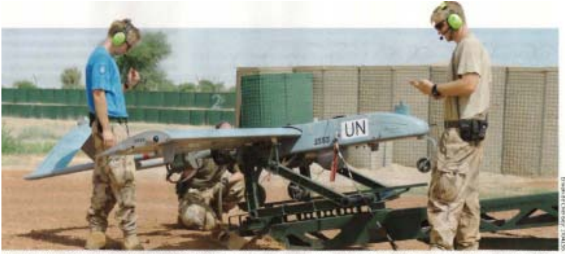
The Swedish ISR task force operates the Tentron Shadow 200 tactical UAV in serveillance missions around Timbuktu. The aircraft is flown from Camp Castor, the Swedish base in Timbuktu, and is not forward deployed to other locations in Nall.